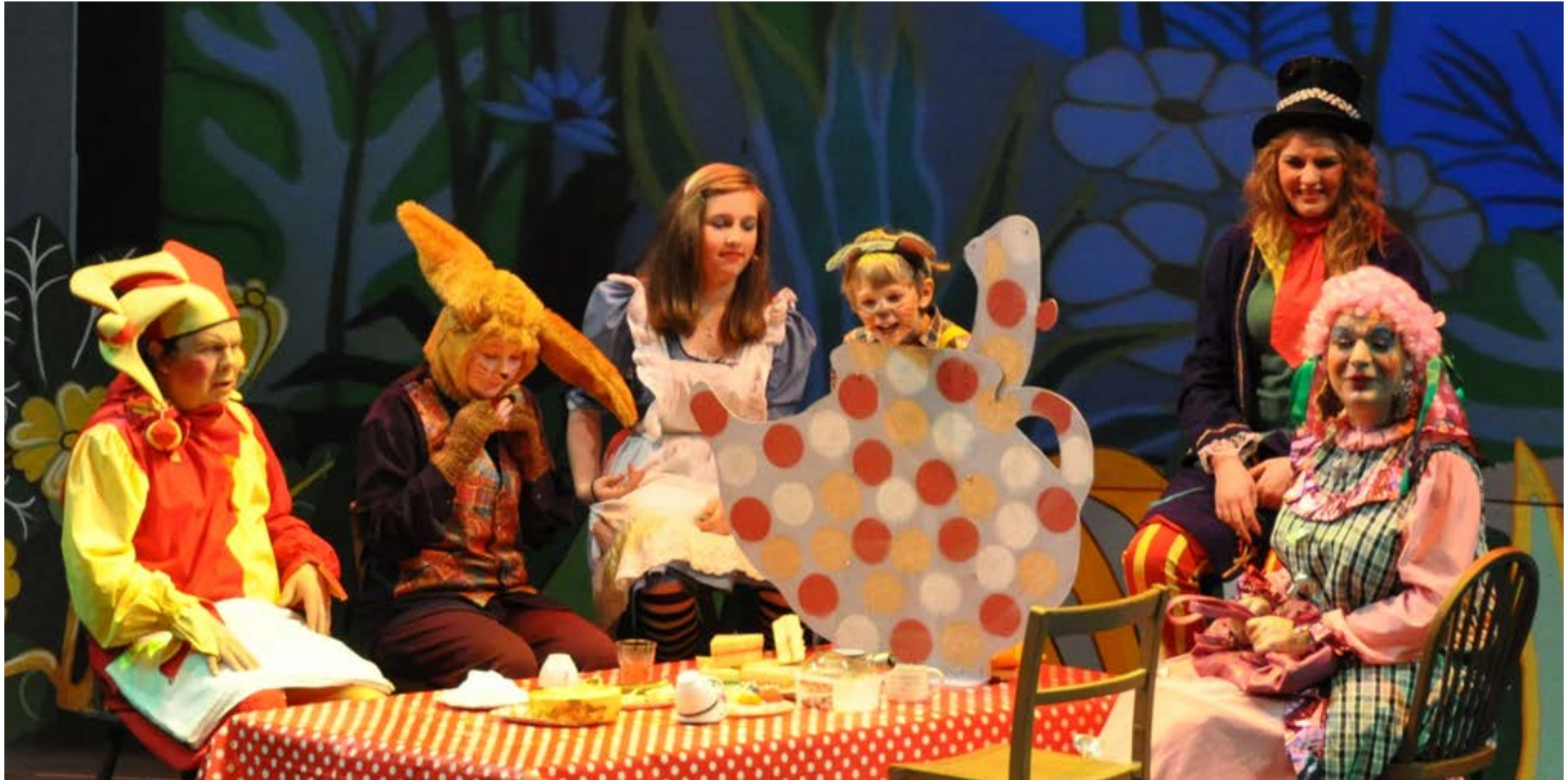
'ALICE IN WONDERLAND' – CODS CHARITY CHRISTMAS PANTO – 2011