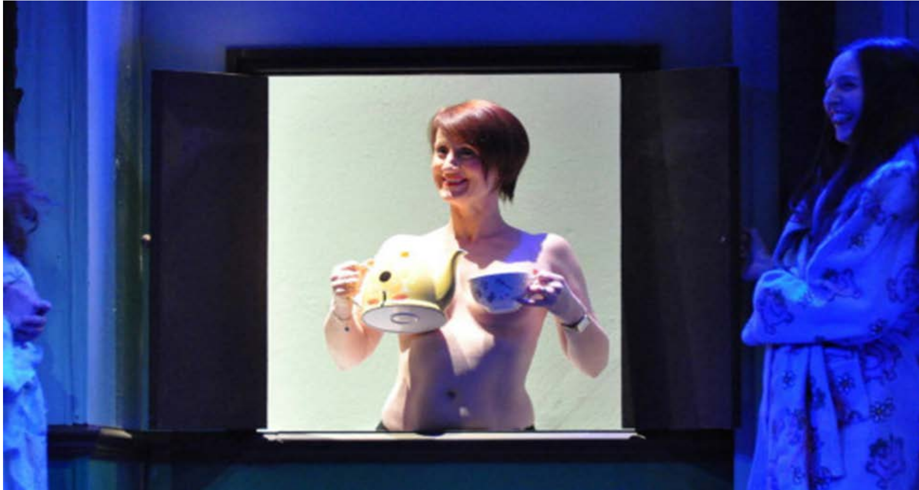
'CALENDAR GIRLS' – CODS SPRING PLAY – APRIL 2013