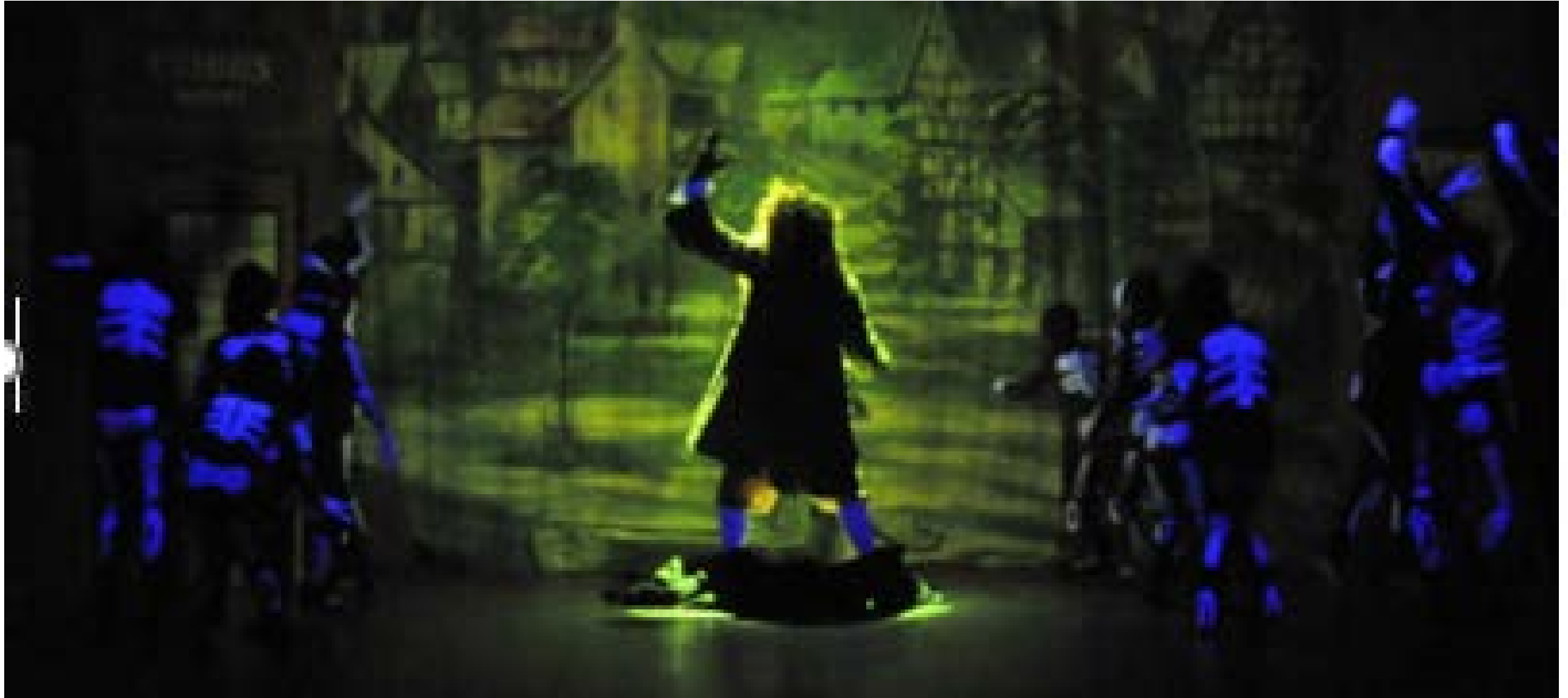
'Beauty and the Beast' – CODS Christmas Pantomime - 2014