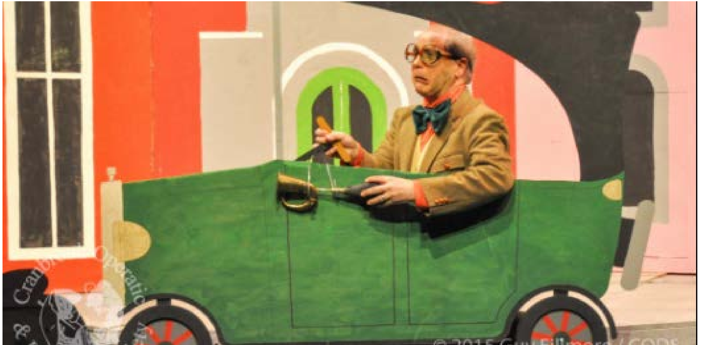
Wind in the Willows – CODS Spring Play – April 2015