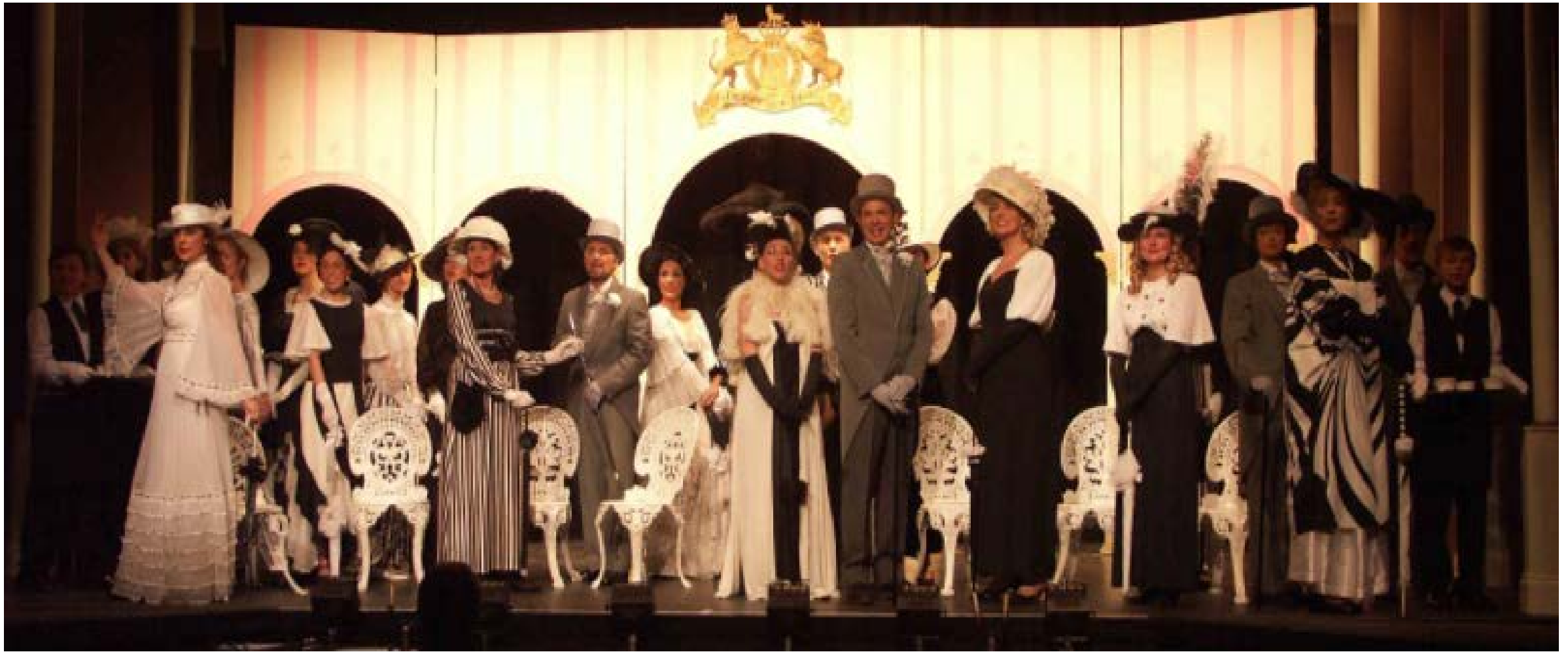
'My Fair Lady' – Cods Autumn Musical – October 2009