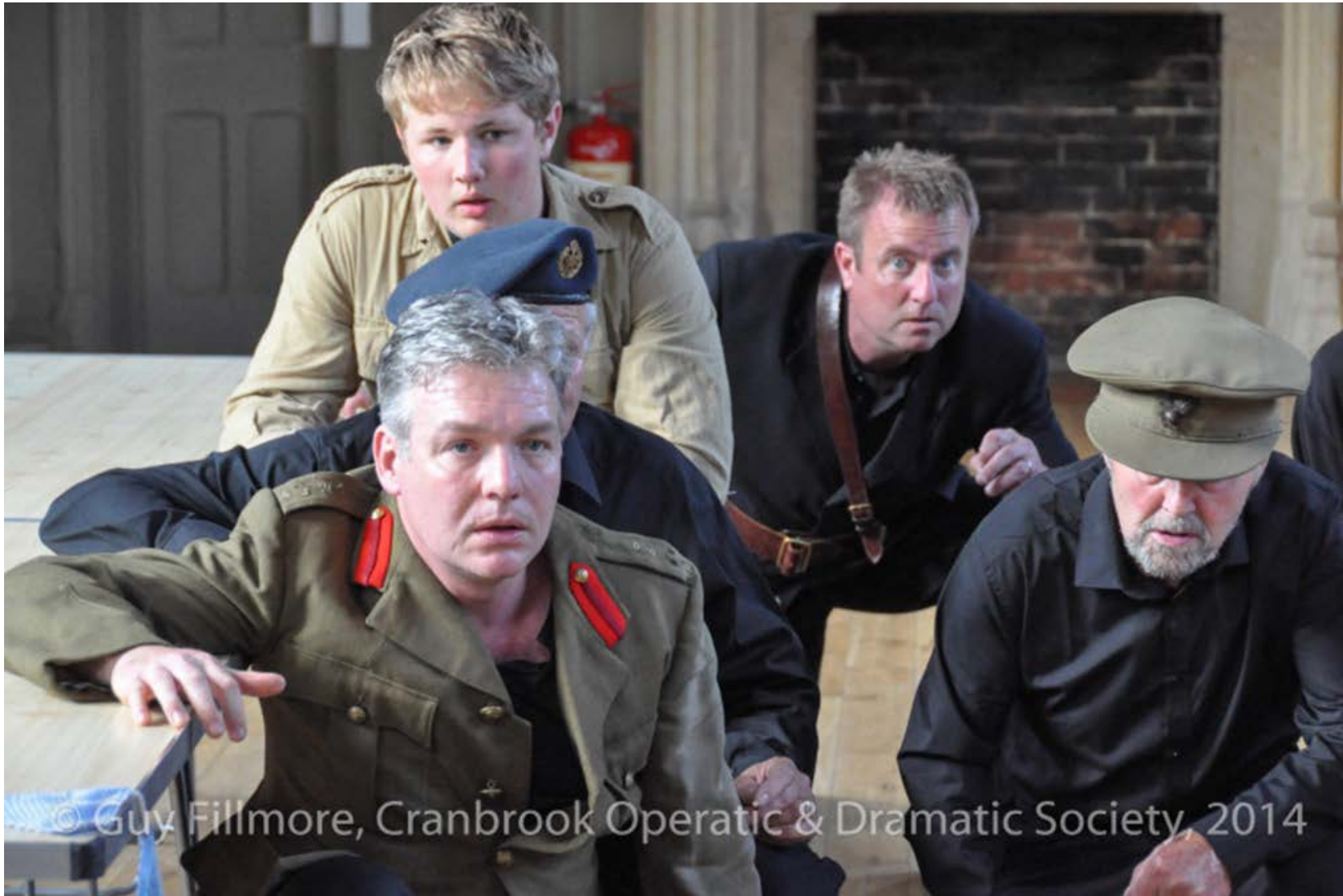
'WAR SHORTS' - CODS' REMEMBRANCE PRODUCTION - SUMMER 2014