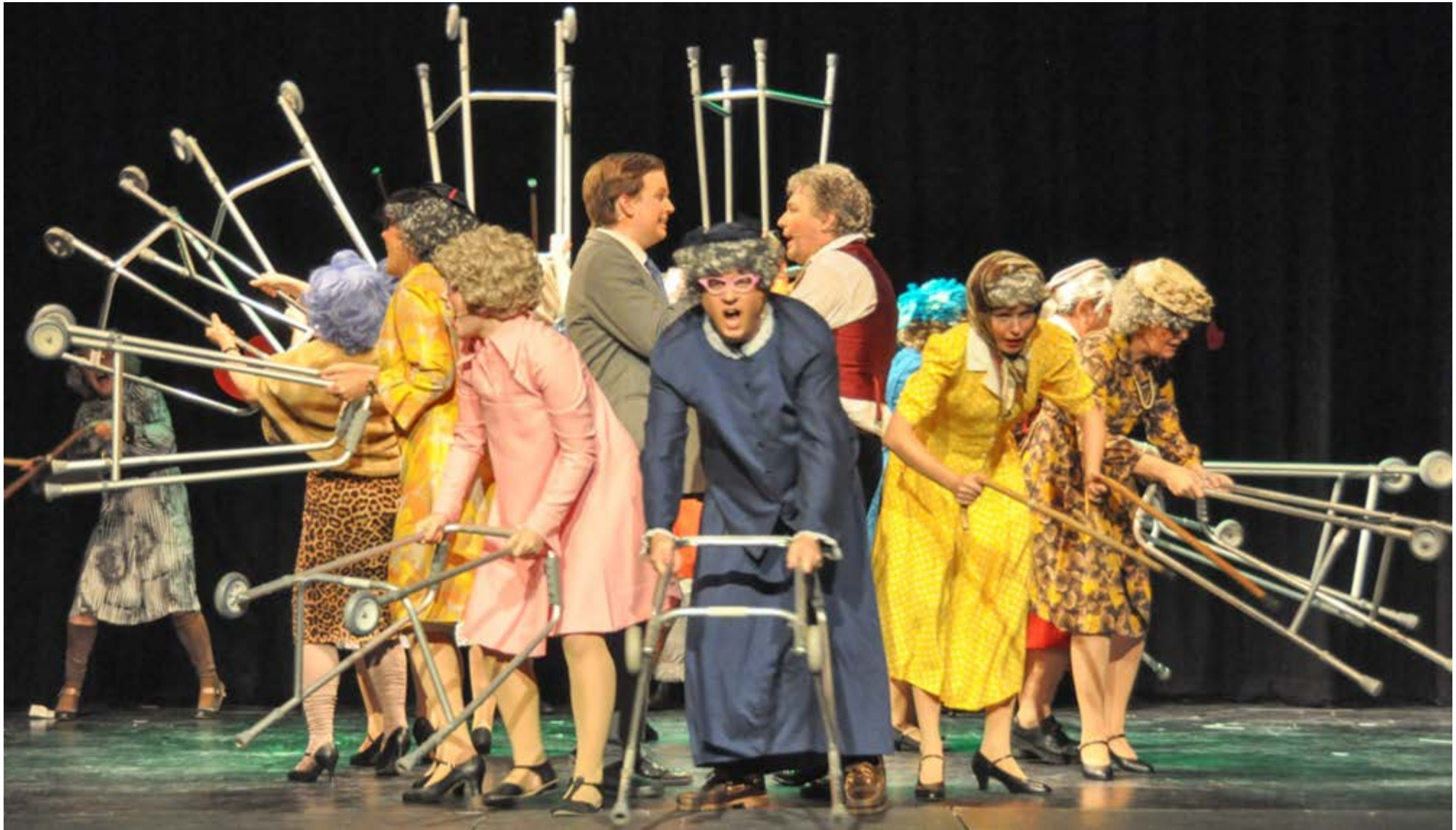
'THE PRODUCERS' - CODS AUTUMN MUSICAL - OCTOBER 2016